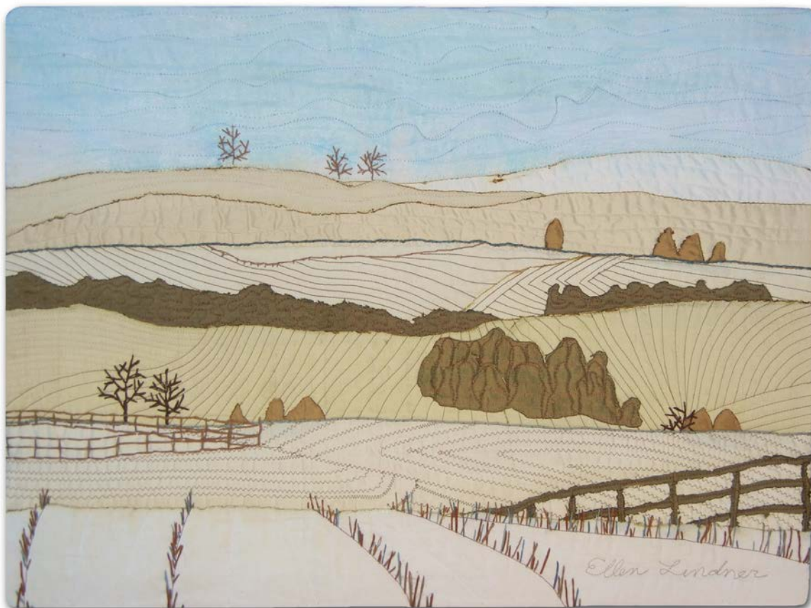
Winter Hills ©2012 Ellen Lindner, 19 × 15 inches, and detail.

"Although blanketed with snow, these corn stalks travel across the landscape, following the contours of the land. Up and down, appearing and disappearing, moving to the quiet rhythm of farm life. A little hand stitching was, to me, the perfect way to feature them. The entire composition is made of silk dupioni, with burnt edges."