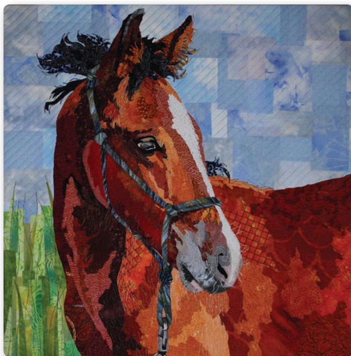
Gypsy ©2016 Barbara Yates Beasley, 20 × 20 inches, and detail.

Shown here are more images featuring Farm Scenes by some of the artists whose work was shown in the March/April 2018 issue of MQU: