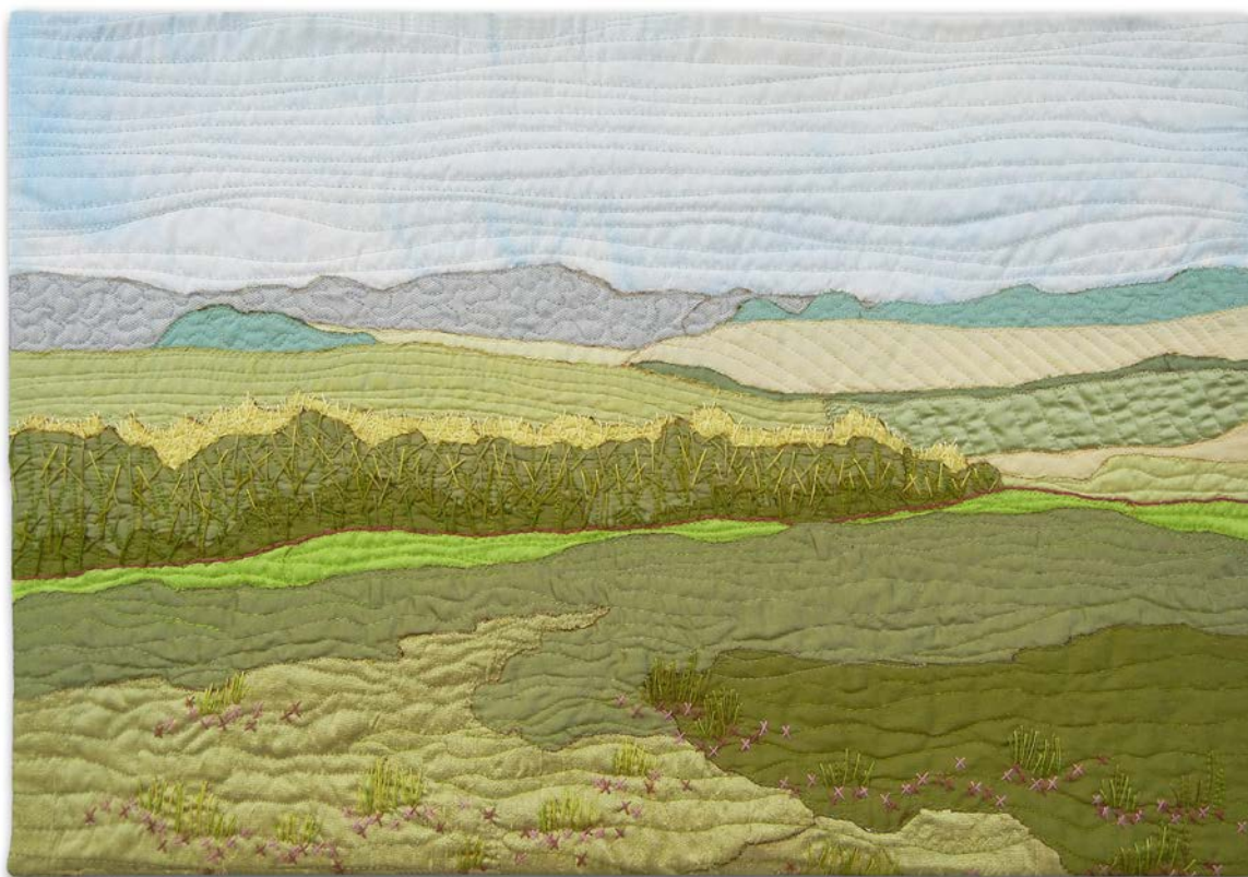
Summer Fields ©2012 Ellen Lindner, 20 × 14 inches, and detail.

"These corn fields are located on my parent's farm in Virginia. The corn is shown tasseling so I used hand stitching to hint at the tangled vegetation. The entire composition is made of silk dupioni, with burnt edges."